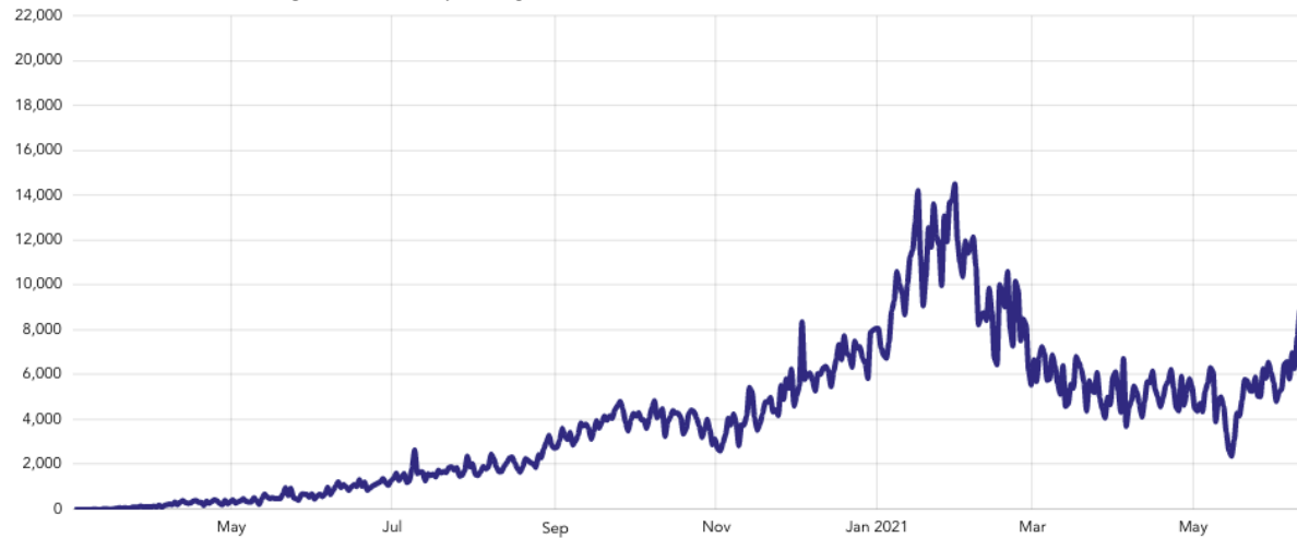
Figure 3. Daily Progress of Positive Confirmed Cases of COVID-19